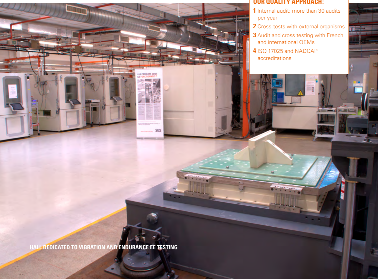
HALL DEDICATED TO VIBRATION AND ENDURANCE EE TESTING

As part of major strategic issues, we offer personalized monitoring of your projects including live videoconferences from the laboratory, technical follow-up calls, and daily or weekly reporting.